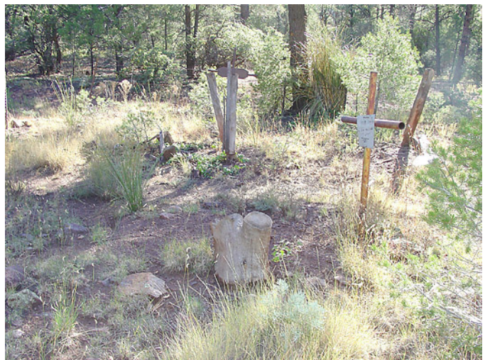
View 4 — Side (right)