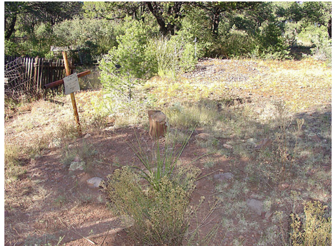
View 2 — Side (left)