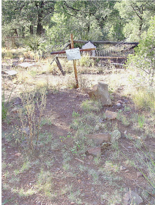
View 1 — Main (front)