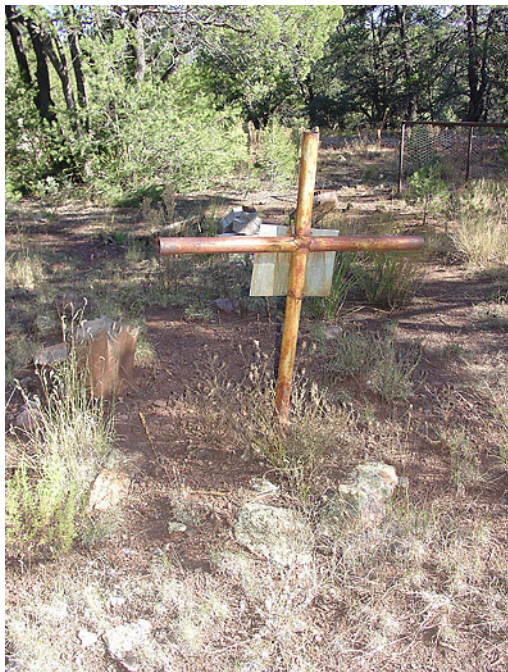
View 3 — Back