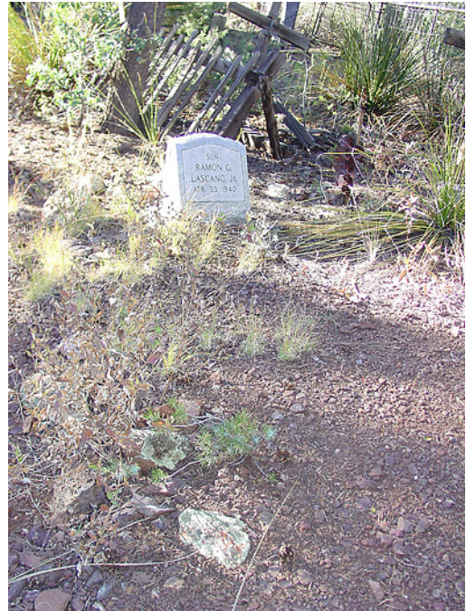
View 2 — Side (left)