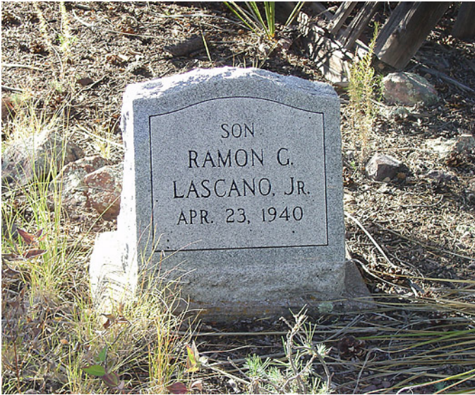
View 1 — Main (front)