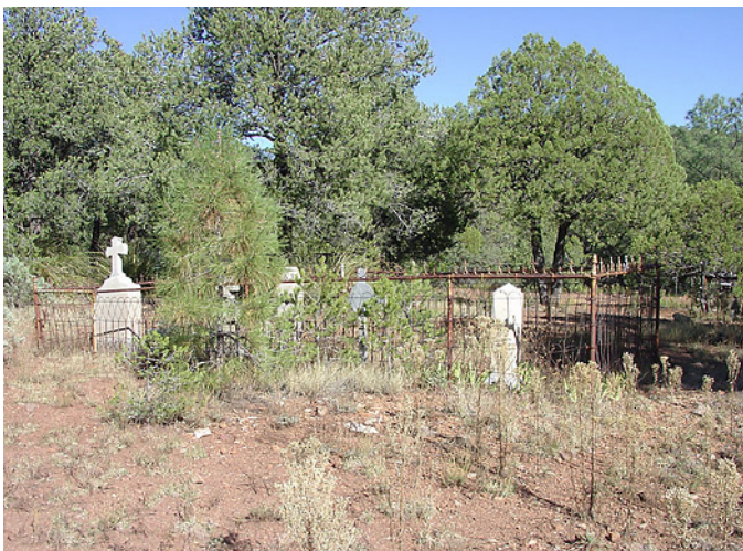
View 3 — Back