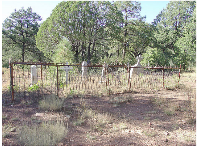
View 2 — Side (left)