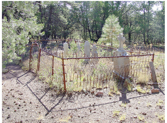
View 4 — Side (right)