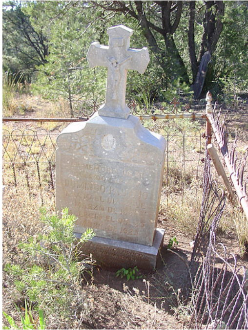
View 1 — Main (front)